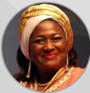
Hon. Célestine Ketcha Courtes Minister of Housing and Urban Development Cameroon